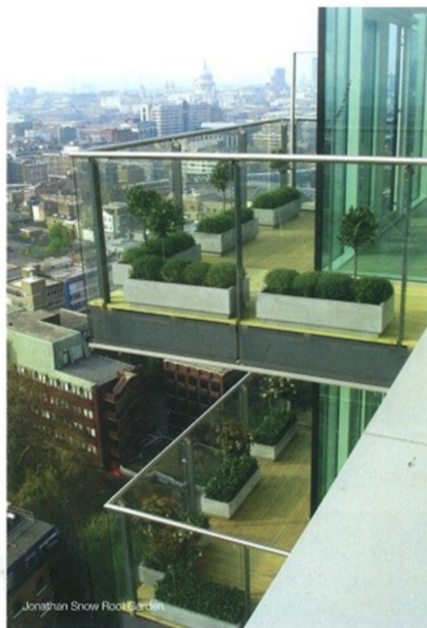
Jonathan Snow Roof Garden