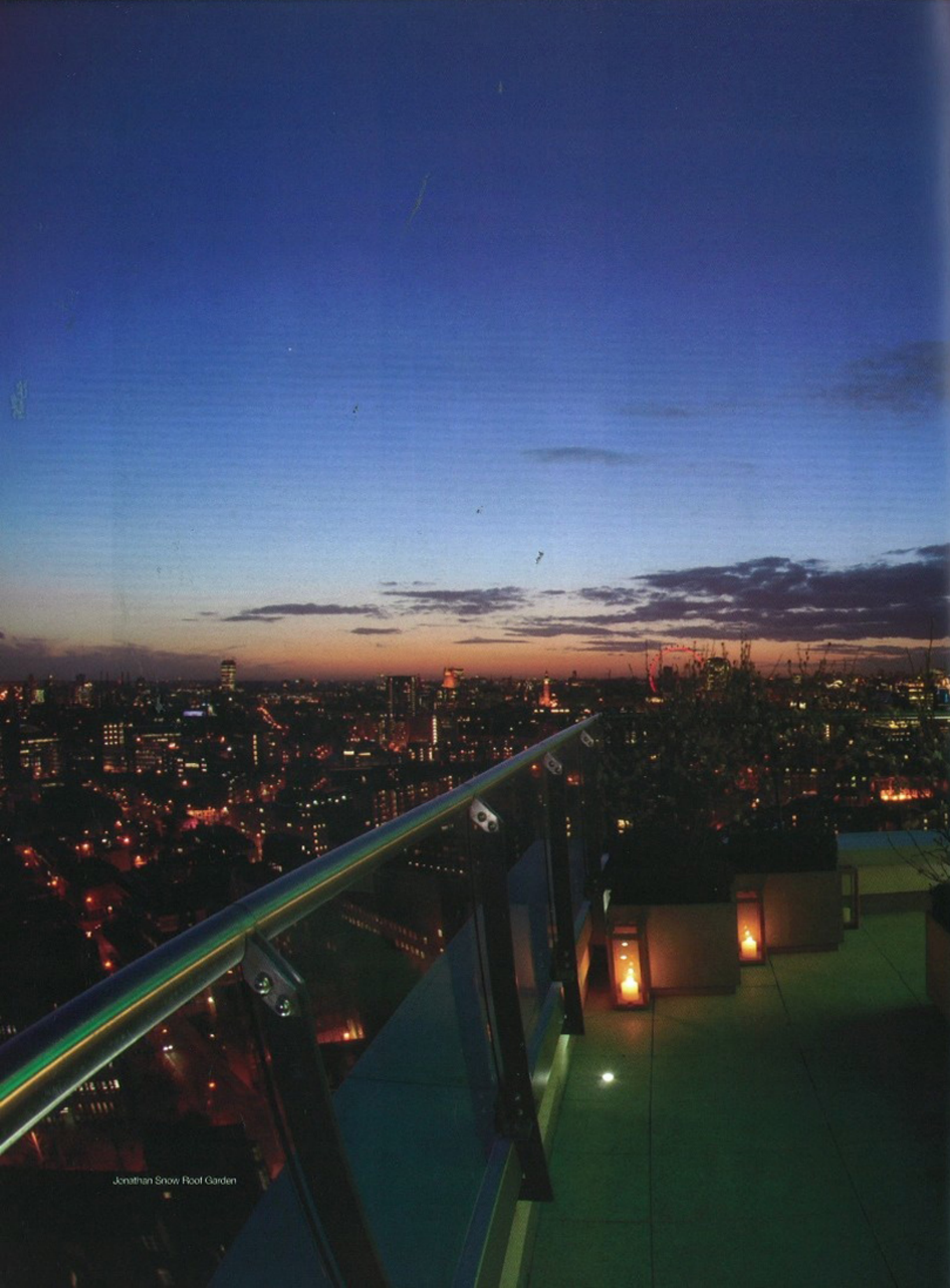
Jonathan Snow Roof Garden