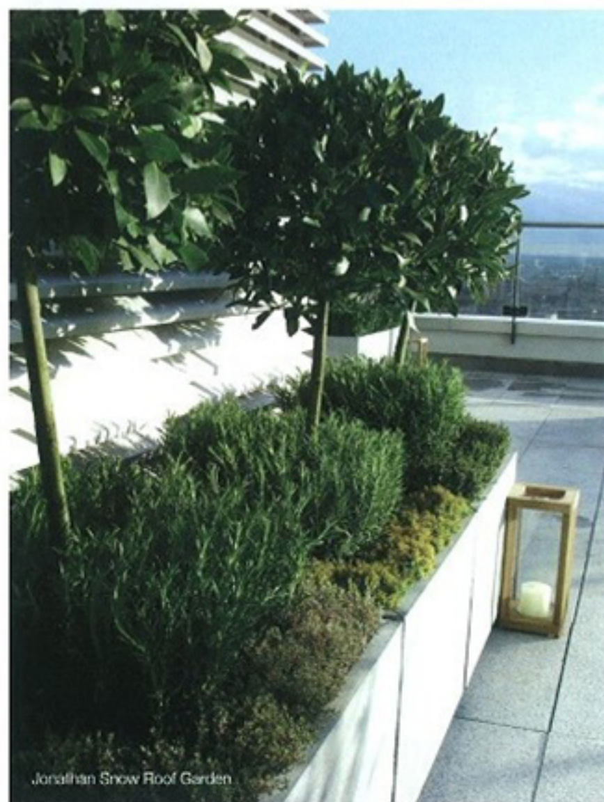
Jonathan Snow Roof Garden

Jonathan favours mature trees and fairly regimented neat planting of box. "I never cease to be amazed at the different shapes and sizes of trees that you can now buy in some of the larger nurseries. You can also buy trees that have been trained, pruned or pleached into any shape you like, which is great if you want to rely on plants to define your spaces rather than hard landscaping."