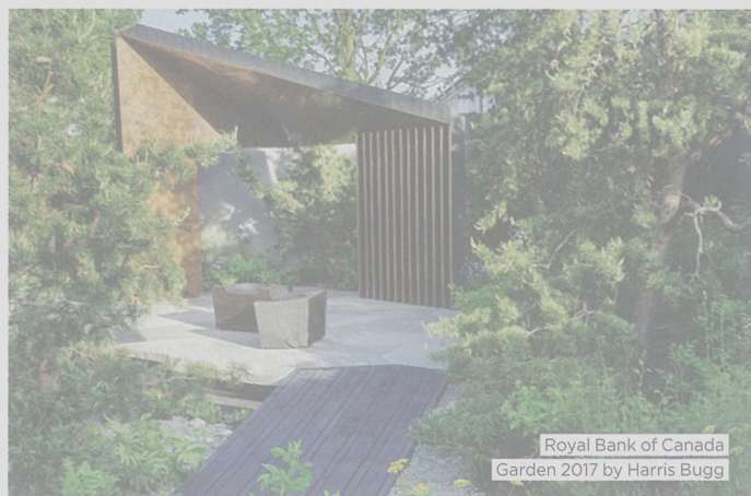
Royal Bank of Canada Garden 2017 by Harris Bugg

Ben, Chris and the team at Innoscape specialise in traditional landscaping with a modern edge. Expect intricate drystone walling with copper details, rills and collaborations with artisan contractors. Book well in advance. Ply them with good coffee.