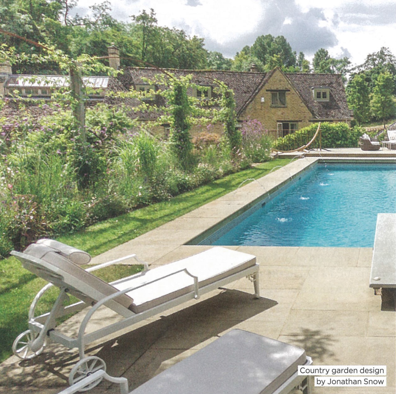
Country garden design by Jonathan Snow